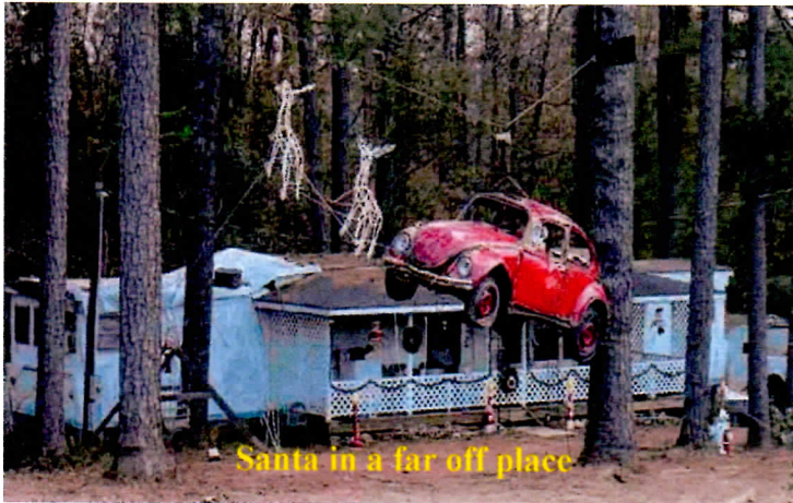
Santa in a far off place

It is that time of year when a break is needed by all to recharge ones batteries, update, modify and generally prepare for next years assault. As well it gives our Officials ,recovery and helpers time to get to know their families again. We have a Calendar set for the year ahead, it is included with this Newsletter ,along with a 2012 Membership form. If your have not joined for the year ahead yet, fill it in & send it back to the membership secretary. Address on form at the bottom. Go on ,you can do it!